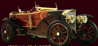
1911 Mercedes 90hp Boatall Skiff Designed and restored by Dale Adams Enterprises, 1994