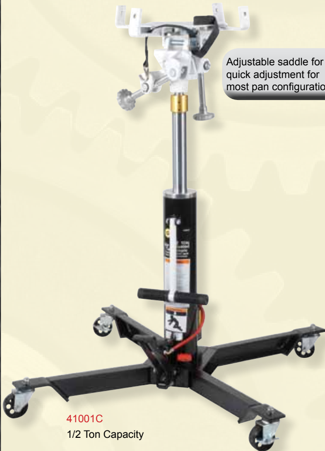
41001C 1/2 Ton Capacity

Adjustable saddle for quick adjustment for most pan configurations